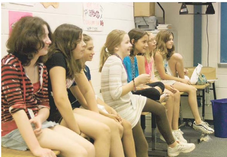
Campers watch intently as their counselors demonstrate the next improvisation exercise that they will play.

ON THE COVER: Participants of the Robinson Secondary School Drama Camp practice a musical number for their end of the week show.